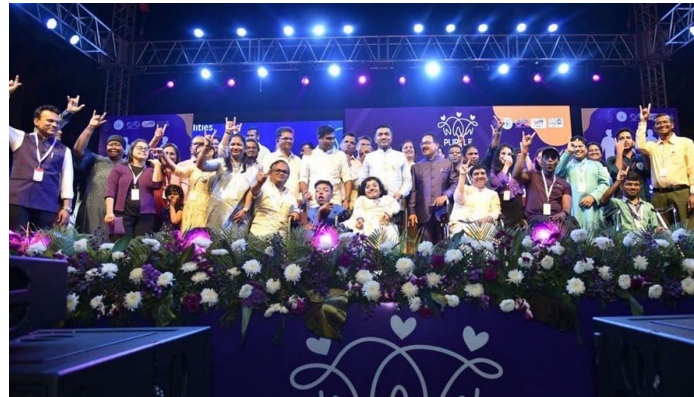
Team Attended a Live Concert by Padma Shri Shanker Mahadevan and his Academy