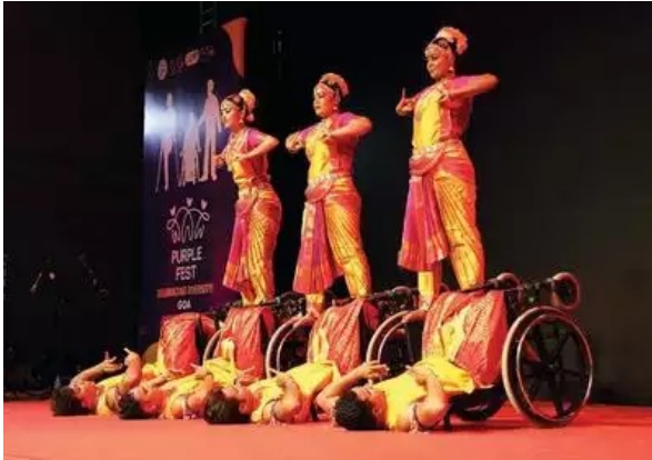
A wheelchair dance performance by the 'We Are One' dance academy